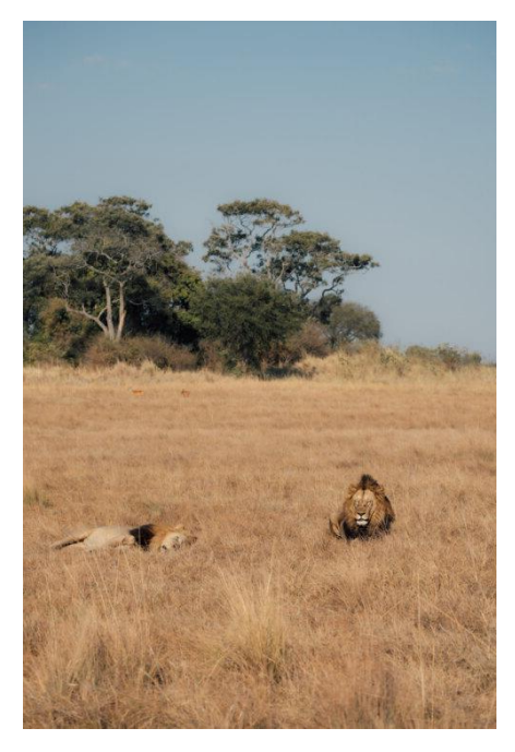
Day 5 You will be transferred back to Busanga airstrip for your light aircraft flight directly to the Lower Zambezi National Park.